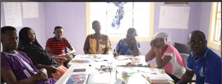
Epie Language Primer Construction

Bible translation and literacy instruction go hand in hand. Once a Bible translation is completed in an indigenous language, the next step is to teach the illiterate how to read it. This need creates a great opportunity for discipleship and evangelism. This is the foundational principal of Literacy & Evangelism's mission to equip the Church to share the gift of reading while sharing the message of Christ.