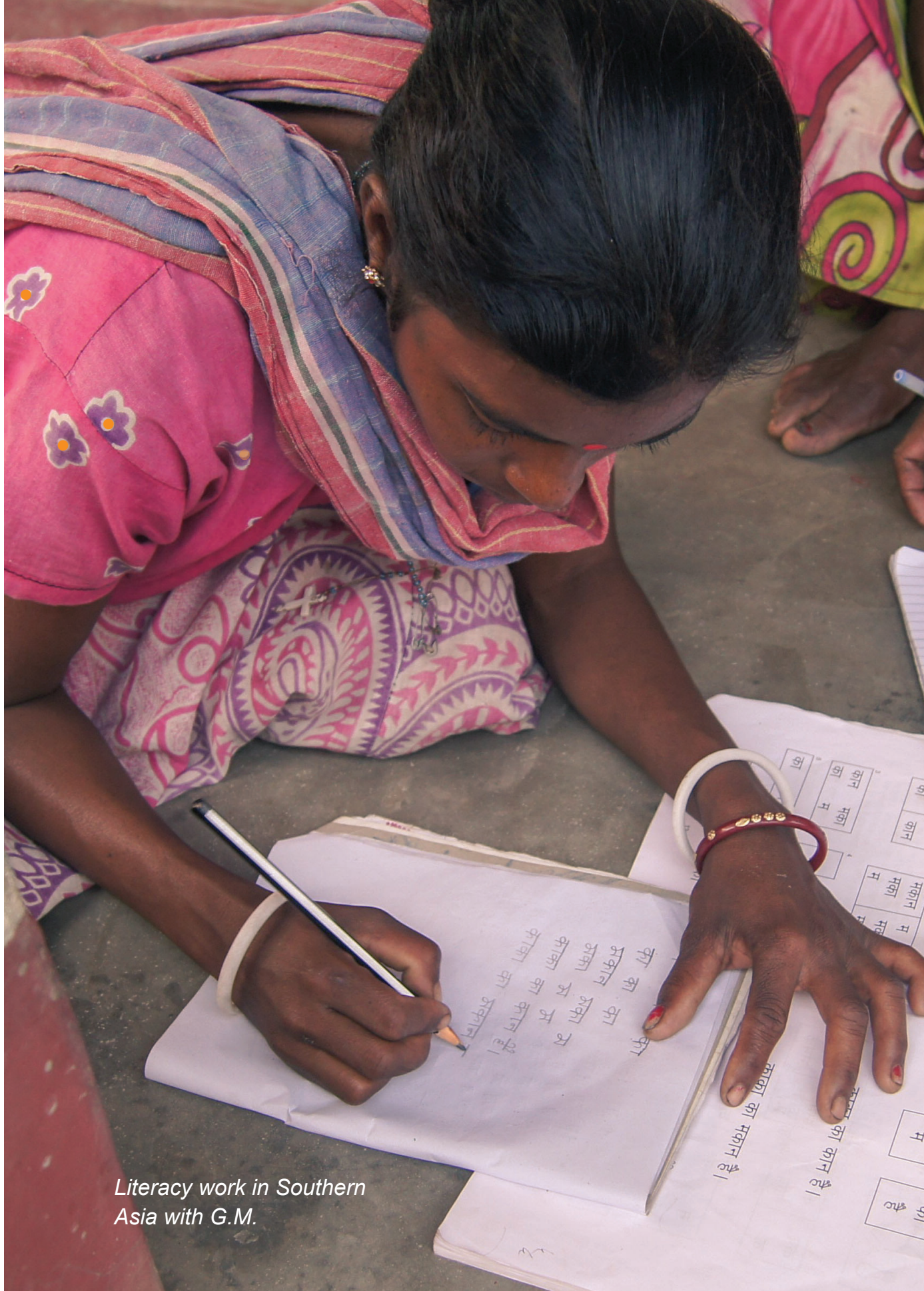
Literacy work in Southern Asia with G.M.