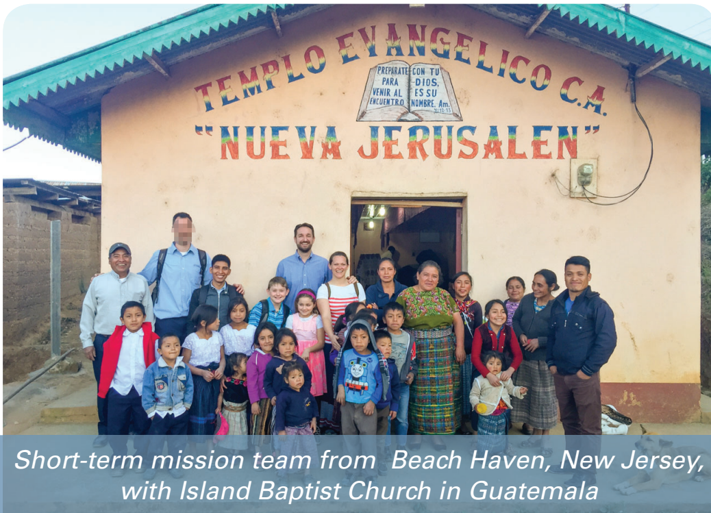
Short-term mission team from Beach Haven, New Jersey, with Island Baptist Church in Guatemala

These and countless others have shared the message of Jesus Christ by sharing the gift of reading - locally, nationally, and internationally. Is our Lord calling you to Literacy & Evangelism ministry?