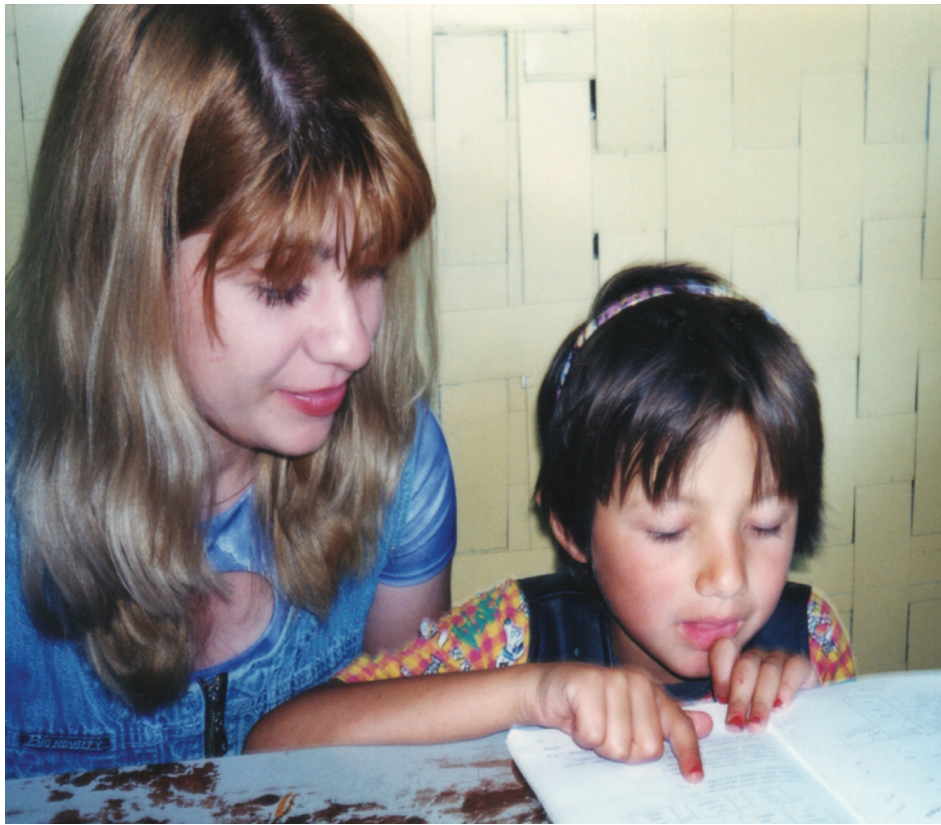
Svetle helps a six-year-old learn to read in Sophia, Bulgaria

Portuguese - Portugal '95 Passport to the World of English (ESL) '96 Turkish - Turkey '96 Bulgarian - Bulgaria '98 Romani - Romania '99 Romanian - Romania '99 Hungarian - Hungary '99 Total = 7