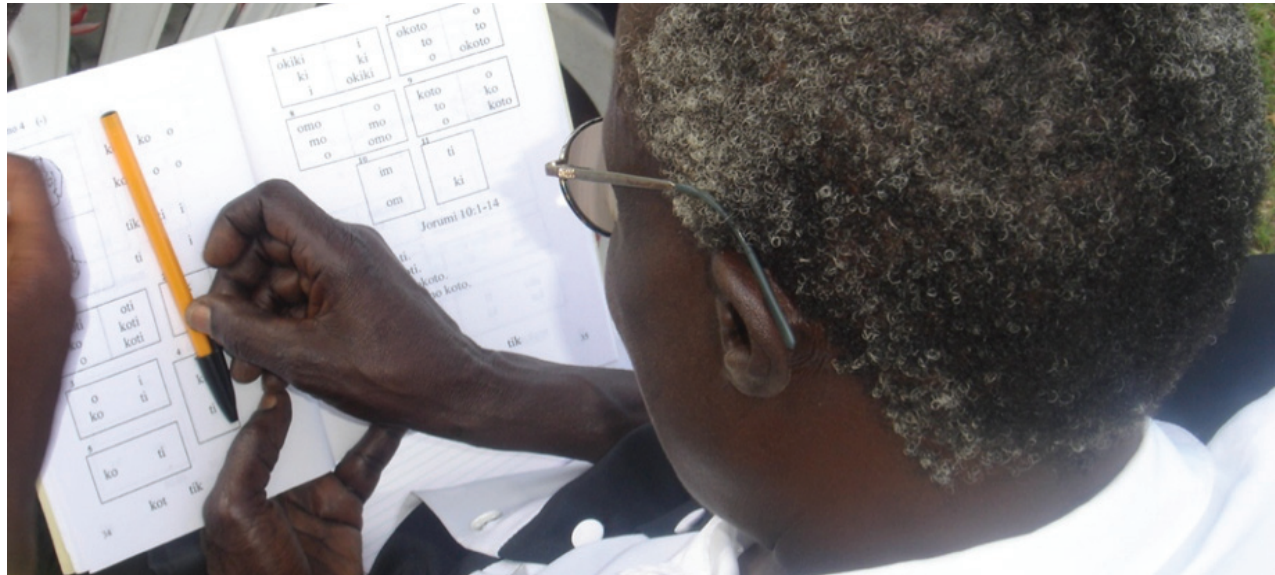
Using the Luo Primer of Kenya to learn to read the word “koti” (jacket)

The story of L&E Kenya starts in the early years of 1970. A story is told of the dream of an American missionary who was also a veterinarian working among the Maasai. He longed to help this nomadic tribe keep healthy herds of cattle, as well as, to preach the Good News about Jesus. After a year or so of treating the cattle and distributing tracts, he realized his work would be much easier if the community he was working in could read. He shared his burden of helping the people learn to read with the local church leadership. The church leaders realized that a literate community would also help in their church planting and discipleship ministry. What started as an individual concern later received approval, and a group of Christian leaders came together to spearhead this work of making the Maasai community literate.