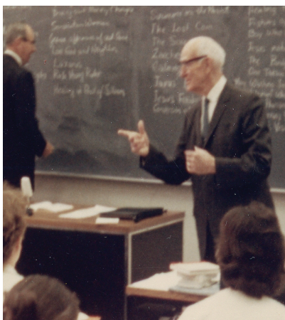
LEI is greatly influenced by the work of Dr. Frank Laubach.