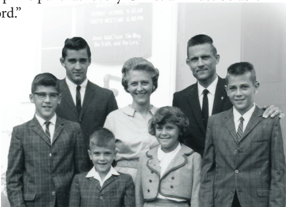
The Rice family circa 1963

1960 - “adult illiteracy had reached an estimated total of 740 million.”