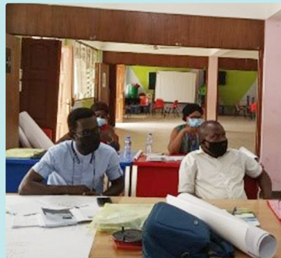
Teacher Training Workshop, Trinity United Church

April: In the month of April, we continued work on editing the Konkomba and Hausa primers . We prepared materials for further primer construction and trainings.