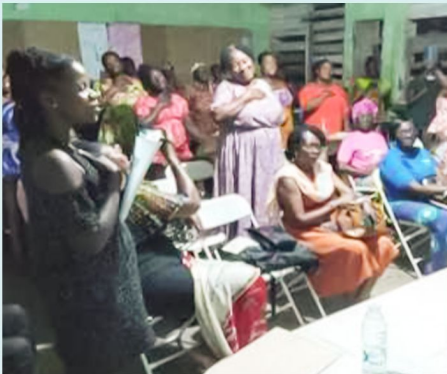
Literacy Class, FGBMFI at Tema

They set up the literacy classes for the market women a few weeks after their training. This class of market women only is the first of its kind in our setup. The class also engages in morning devotions, open to all in the market and is led by the ladies of FGBMFI who also double up as the teachers for the evening literacy classes.