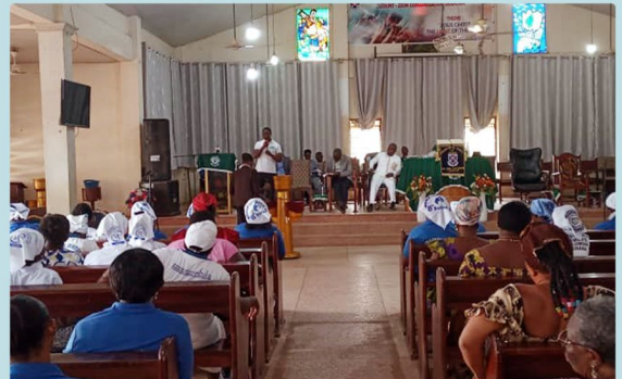
8 September, 2022 - World Literacy Day Celebration at Dodowa