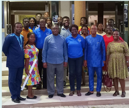
Trainer of Trainers Workshop for Church of Pentecost, Koforidua Area