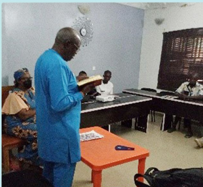
Primer Construction, Hausa in Abuja, Nigeria