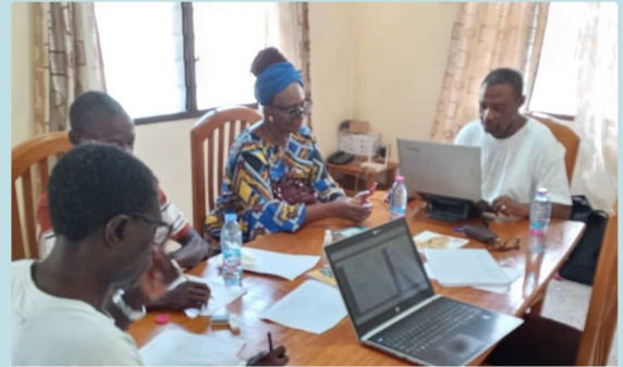
Nzema Primer Construction Workshop, Accra