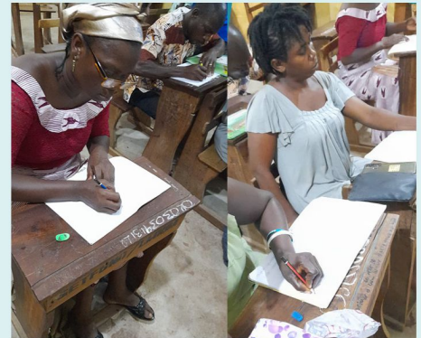
COP Kaneshie Literacy Class (Final Exams)

November: By God's grace we were able to print and send copies of the Hausa and Tangale primers to our colleagues in L&E Nigeria for their TTW and launch of both primers.